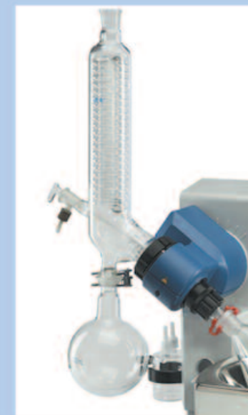
Vertical Coil Condenser