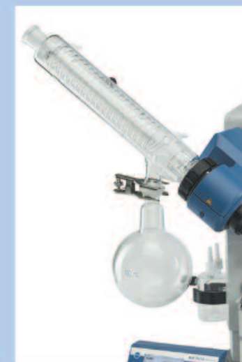
Diagonal Coil Condenser