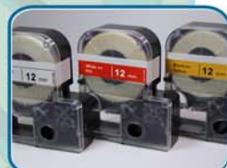
Replaceable tape cassettes (26ft / 792cm length)