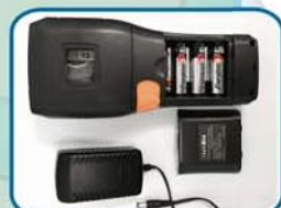
Available with 9V power supply (also runs off 6 AA batteries)

With over 12 available sizes, colors & material combinations, the LABeler is ideal for label identification of any laboratory vessel for nearly any laboratory application. Standard label tapes can be autoclaved, boiled or even frozen to temperatures as low as -50°C. Special Ultra-Low label tapes are also available for storage in -80°C environments or for liquid nitrogen applications.